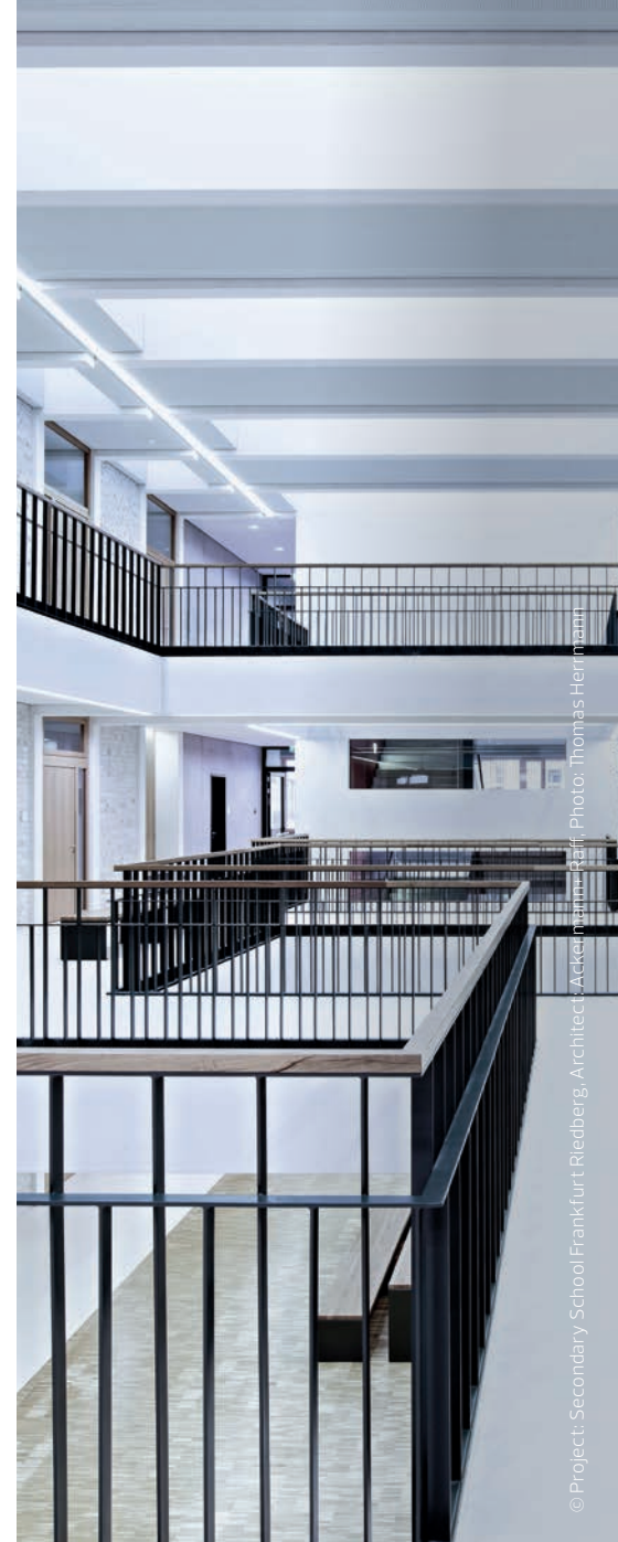
© Project: Secondary School Frankfurt-Riedberg, Architect: Ackermann+Partl